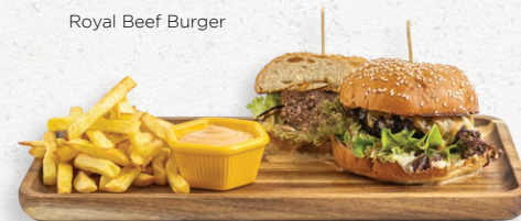
Royal Beef Burger

Signature homemade patties with freshly brioche bread with signatures sauce and crispy french fries on side.