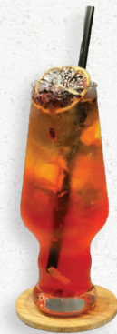
Hibiscus Ice Tea 25 AED

A captivating combination of coconut and Blue Lagoon Flavors, enhanced with lemon.