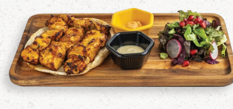
Shish Tawook Plate