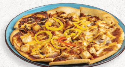
BBQ Chicken Pizza