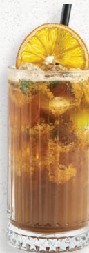
Coffee Mojito 25 AED

A delightful blend of peach, cranberry juice, and organic tea.