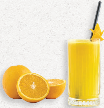
Orange 19 AED