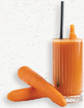
Carrot 19 AED