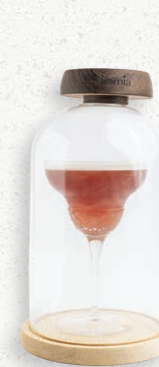
Smoke Dope Juice 25 AED

A refreshing fusion of lime, strawberry fruit, and passion fruit, topped with hibiscus flowers.