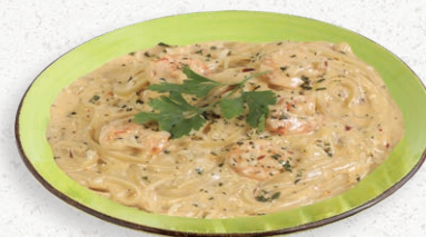
Creamy Shrimp Pasta

Freshly shrimp with creamy cajun sauce and linguine pasta.