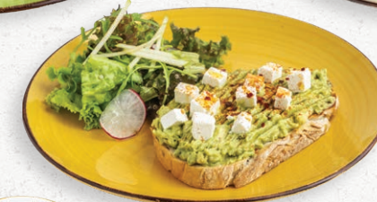
Bendict Avocado Toast