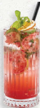
Presca Juice 25 AED

A harmonious blend of lavender, guava, and organic hibiscus tea, topped with soda.