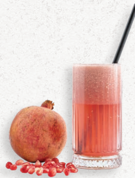
Pomegranate 26 AED