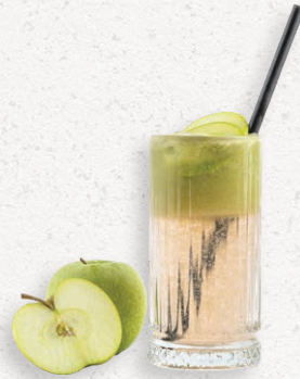
Green Apple 19 AED