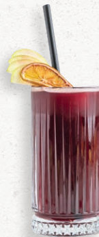
Fresh Cocktail 26 AED