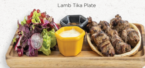
Lamb Tika Plate