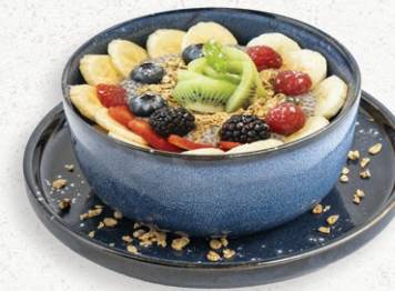
Acai Pudding Bowl