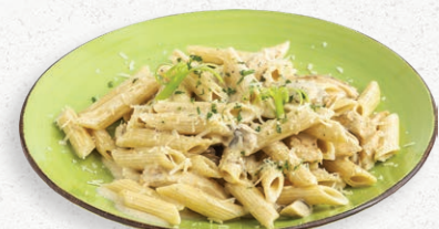
Parmesan Chicken Pasta

Delicious creamy pasta with freshly breast chicken with mushroom topped up with parmesan cheese.