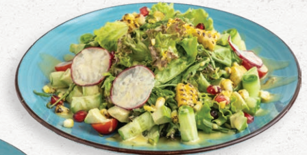
Summer Corn Salad