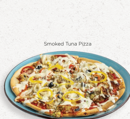
Smoked Tuna Pizza

Homemade pizza dough with mashed avocado and smoke tuna hint of spice /slice white onion/ sliced black olives topped up signature ranch sauce.