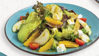
Apple Orange Salad