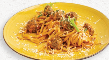
Meet Balls Pasta

Mix linguine pasta with a delicious homemade meet balls topped up with parmesan cheese.