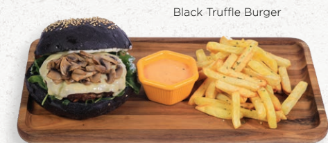
Black Truffle Burger

Freshly beef meat with signature truffle paste and signature sauce with french fries on the side.