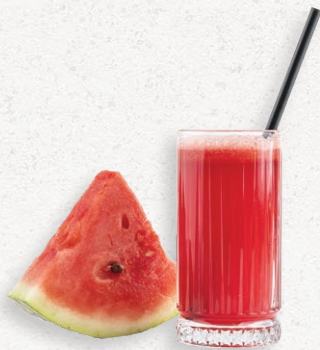
Water Melon 21 AED