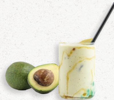
Avocado Honey 26 AED