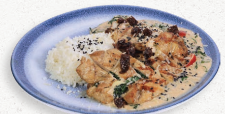
Grilled Chicken Spanish