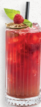
Kar-ka-del Juice 25 AED

A refreshing beverage infused with lime, raspberry fruits, cucumber, and watermelon flavour, topped with soda water.