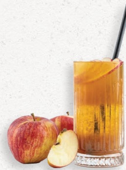
Red Apple 19 AED